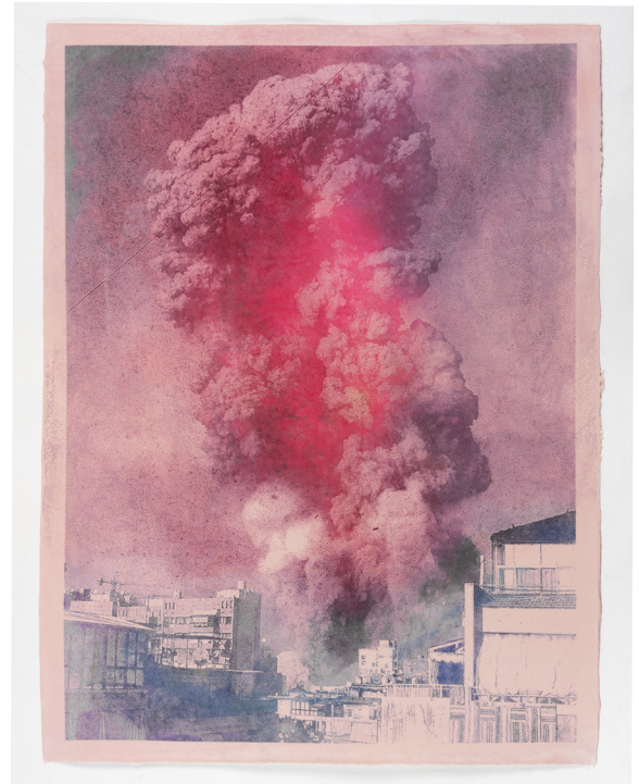
Nazanin Noroozi, Beirut 200804 #1 , from the series This Bitter Earth , 2022, Pigmented linen pulp on cotton base sheet, 40" x 30".

This Bitter Earth Nazanin Noroozi is curated by Eliana Blechman.