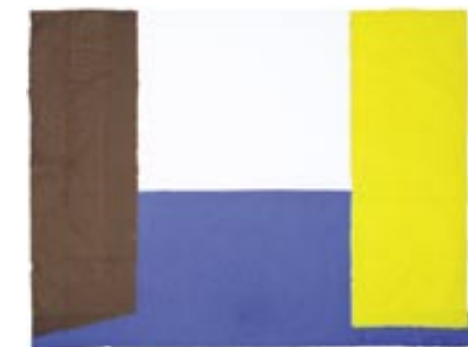
Untitled , 2006 pigmented pulp on handmade paper 60 x 40 inches (152.4 x 101.6 cm)