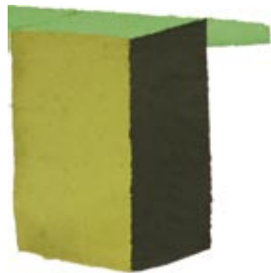
Untitled , 2005 stenciled pulp paint on cotton base sheet 29.5 x 40 inches (76.2 x 101.6 cm)